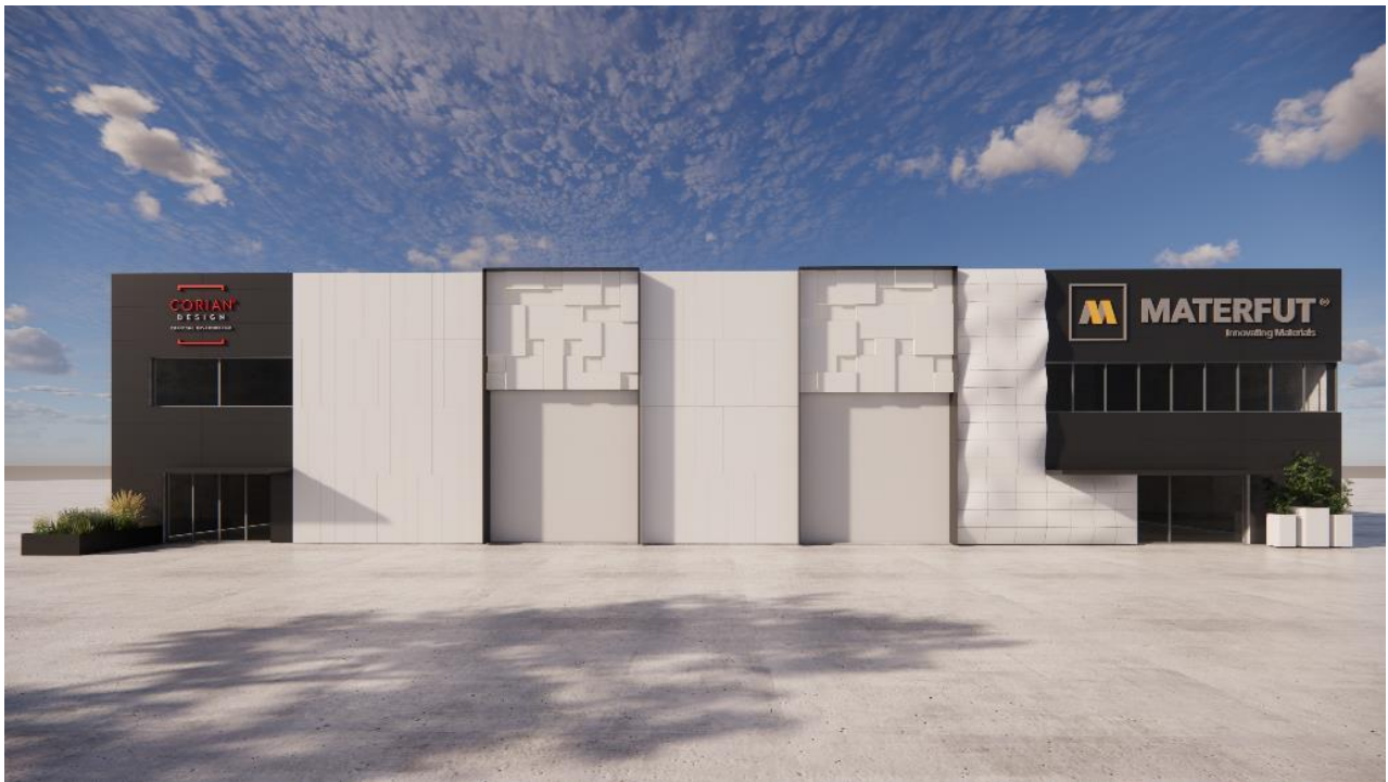
Materfut® Headquarters, Portugal. The façade with Corian® Exteriors panels (made with Corian® Solid Surface) presents different shaping possibilities, including organically shaped panels created with parametric design; Design by architect Alexandre Sousa Lopes; manufacture and installation of Materfut®; Image by Materfut®, all rights reserved.

The Linea Pannelli wall and the Materfut® facade have been met with great enthusiasm by architects and designers, who see a new world of design possibilities opening up thanks to the use of the new technology developed by Corian® Design. The possibilities become practically infinite and allow the realisation of increasingly customised projects.