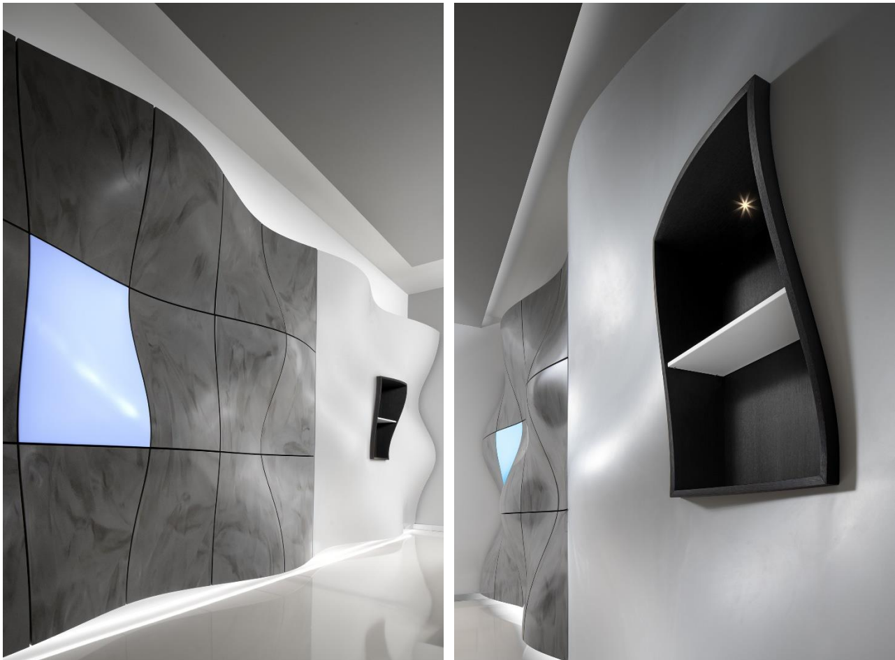
The wall with tridimensional panels made of Corian® Solid Surface in Glacier White and Artista Dust by Linea Pannelli allows architects and designers to imagine endless design possibilities thanks to parametric design

So far, the implementation of such projects was a real challenge due to a long time, high cost, lack of high skilled labour and necessity of the use of wooden moulds. Corian® Automated 3D Fabrication Solution (#CorianShapingTheFuture) removes all these boundaries and brings creative possibilities to a new level - while taking a big step towards sustainability. This is fully digital fabrication technology, 10 times faster than standard solutions – parametric design is uploaded in the software, in no time converted and sent to the reconfigurable mould to shape the required panel.